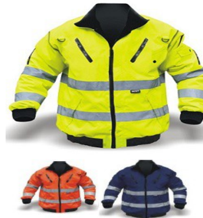
Bunny Jackets (Orange, Lime and Navy)