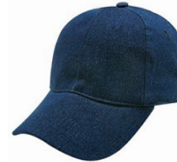
6 Panel Caps R25.00