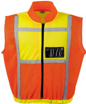
Sleeveless Reflective Orange and Lime jacket

Black, White, Grey, Navy, Royal, Sky, Baby Pink, Stone, Bottle, Lime, Yellow, Orange, Red