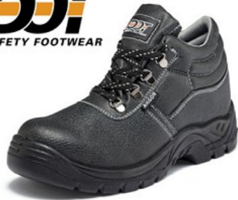
Dot Argon Safety Boots With STC R257.00