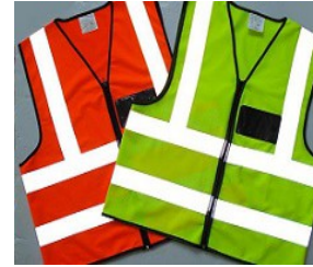
Orange and Lime Reflective Vests R45.00