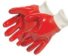
Red PVC Wrist Gloves R15.00