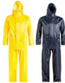
Yellow and Navy Rubberised Two-piece Rainsuits R125.00