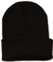
Black Beanies R25.00