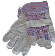
Leather Gloves R27.00