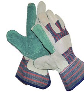
Leather Gloves R35.00