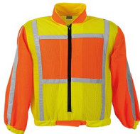
Long Sleeve Reflective Orange and Lime jacket