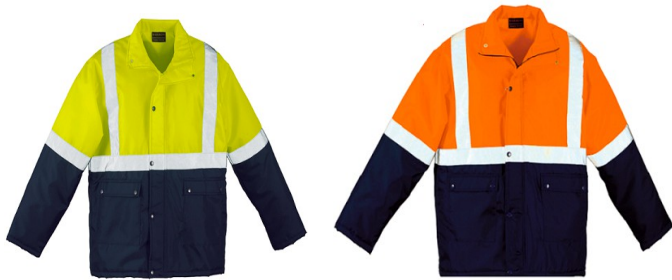
Reflective Parka Jackets in Lime and Orange